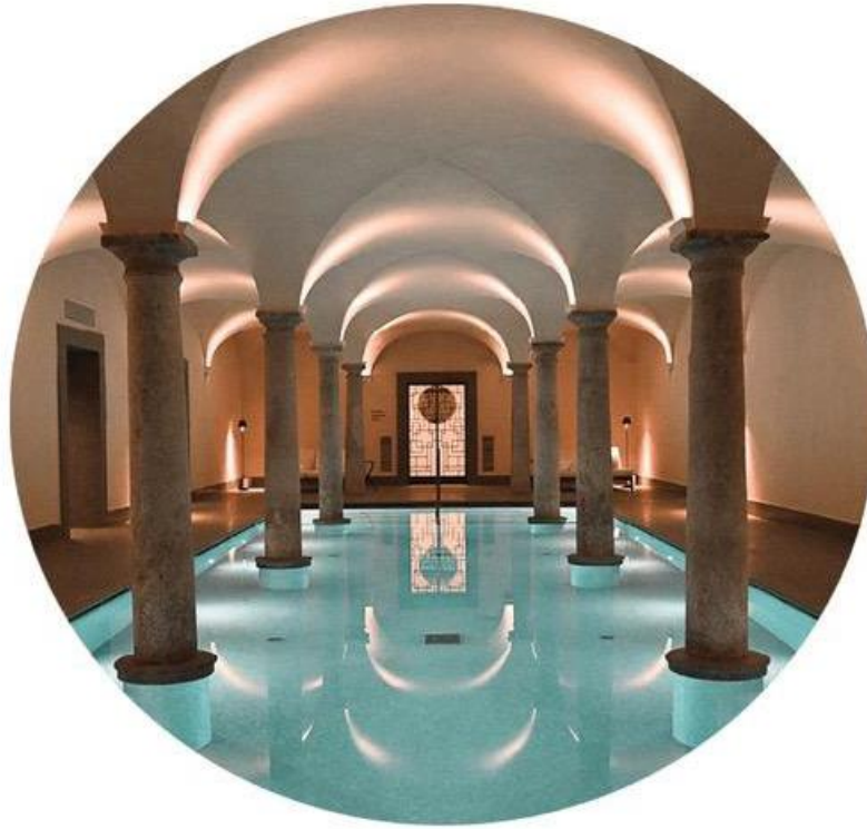
PORTRAIT MILANO TIM LABENDA.

SET WITHIN A FORMER MILANESE SEMINARY, THE LONGEVITY SPA OFFERS A RANGE OF REGENERATIVE TREATMENTS AIMED AT LIFE EXTENSION. (THINK DETOX RITUALS AND ANTI-AGING TINCTURES.) THE INDOOR SWIMMING POOL ALONE IS A STUDY IN GOOD BONES, WITH ITS STATELY COLUMNS AND VAULTED CEILINGS. LUNGARNOCOLLECTION.COM