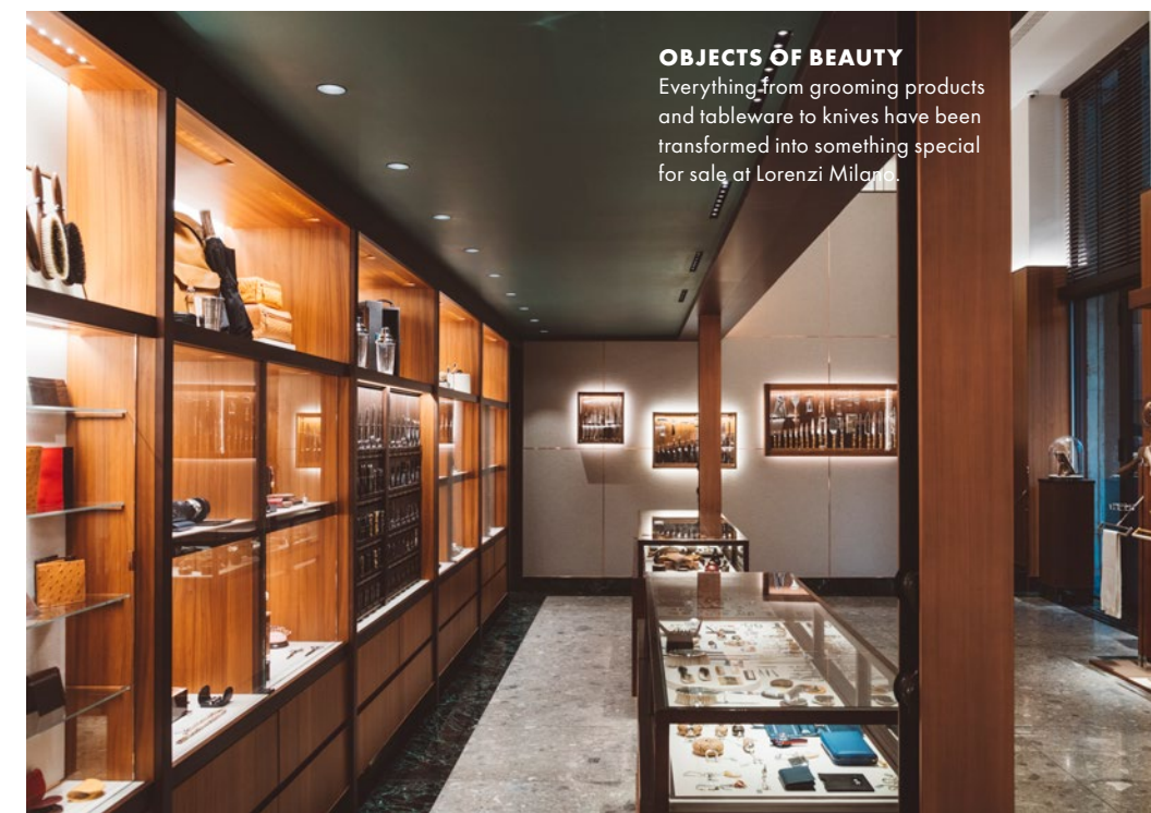
OBJECTS OF BEAUTY Everything from grooming products and tableware to knives have been transformed into something special for sale at Lorenzi Milano.

Lorenzi Milano It's a delight for the eyes to step into this historic shop, where everything is displayed with extreme care. Everyday objects, even the most mundane ones, become special: garment brushes tailored to individual materials from cashmere to tweed, shoe-care travel sets, kitchen utensils, plus knives of all sizes for specific uses. It almost feels like a museum that celebrates a rare refinement in its precious showcases. Piazza Filippo Meda, 3-20121, Milan lorenzi-milano.com