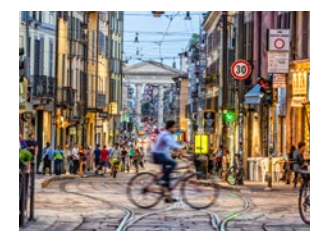
Corso di Porta Ticinese A vibrant street in Milan's Navigli district, it is lined with trendy boutiques, vintage shops and cosy cafes. It is perfect for fashionistas seeking unique finds with a bohemian flair.