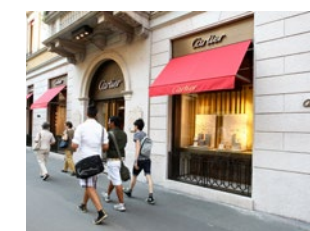
Via Montenapoleone Milan's most prestigious shopping destination, it is home to luxury fashion boutiques from renowned designers. Enjoy haute couture, fine jewellery and upscale accessories along this iconic street.