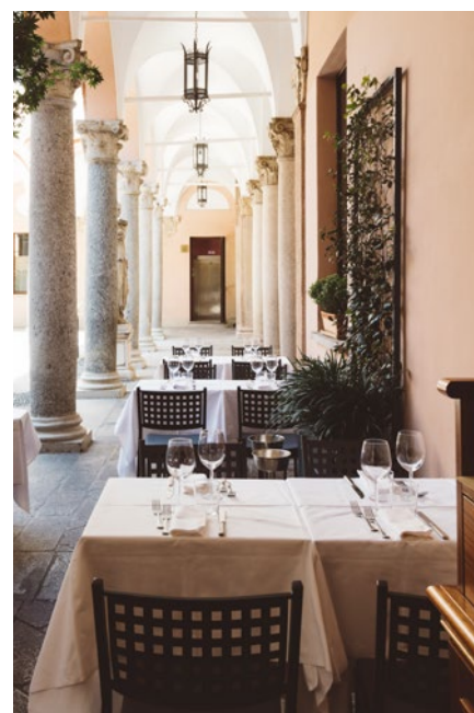
TRADITION MEETS TASTE You must try the tagliatelle alla bolognese at Dal Bolognese (top); Palazzo Recalcati and its courtyard house the restaurant, which is close to the Duomo (above); The interior is both family friendly and refined (left).