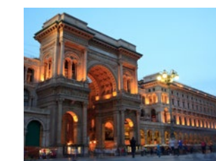
Corso Vittorio Emanuele II Connecting Piazza del Duomo with Piazza San Babila, this bustling avenue features a mix of high-end retailers, department stores and popular brands. Ideal for a day of indulgent shopping.